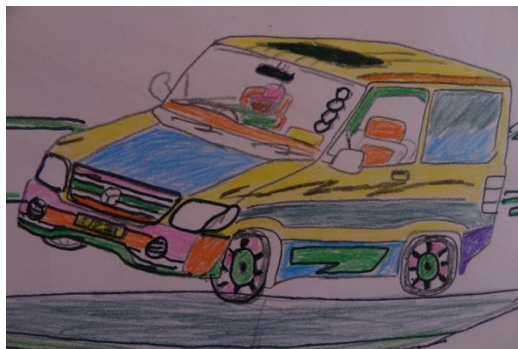
Examples of drawings produced by two children with albinism at Salima School for the Visually Impaired