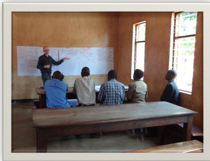
Families of children with albinism participating in a focus group with assistant researcher leading a final discussion

The group of parents at Chilanga focused on the need to be protective of the child with albinism; the child should be protected by the parents at home, by the teachers at school. In the community it is the role of everyone.