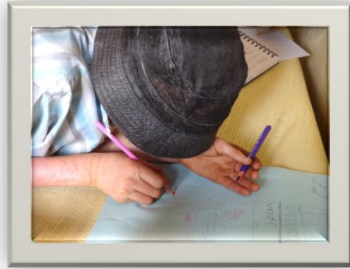
Children with albinism completing an art activity as part of a workshop