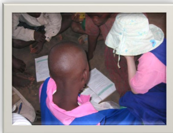
Young girl with albinism sharing a textbook with two other children in a Primary School in Blantyre Rural

'When reading a book, I don't have a personal book so we share in a group of 6 or sometimes 7; I have no chance to hold the book so I struggle to see properly. As a result I just sit in the group. I would prefer if I was holding the book.'